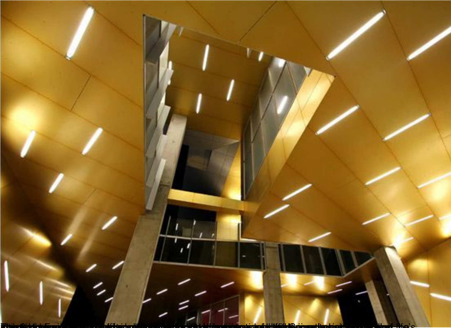
Big 8 House is a mixed-use development in Copenhagen, Denmark, designed by BIG (Bjarke Ingels Group). The building features a prominent concrete structure and a warm, golden-brown color scheme. The interior is characterized by large, illuminated panels and a series of concrete columns and beams. The building is a prime example of modern architecture and sustainable design.