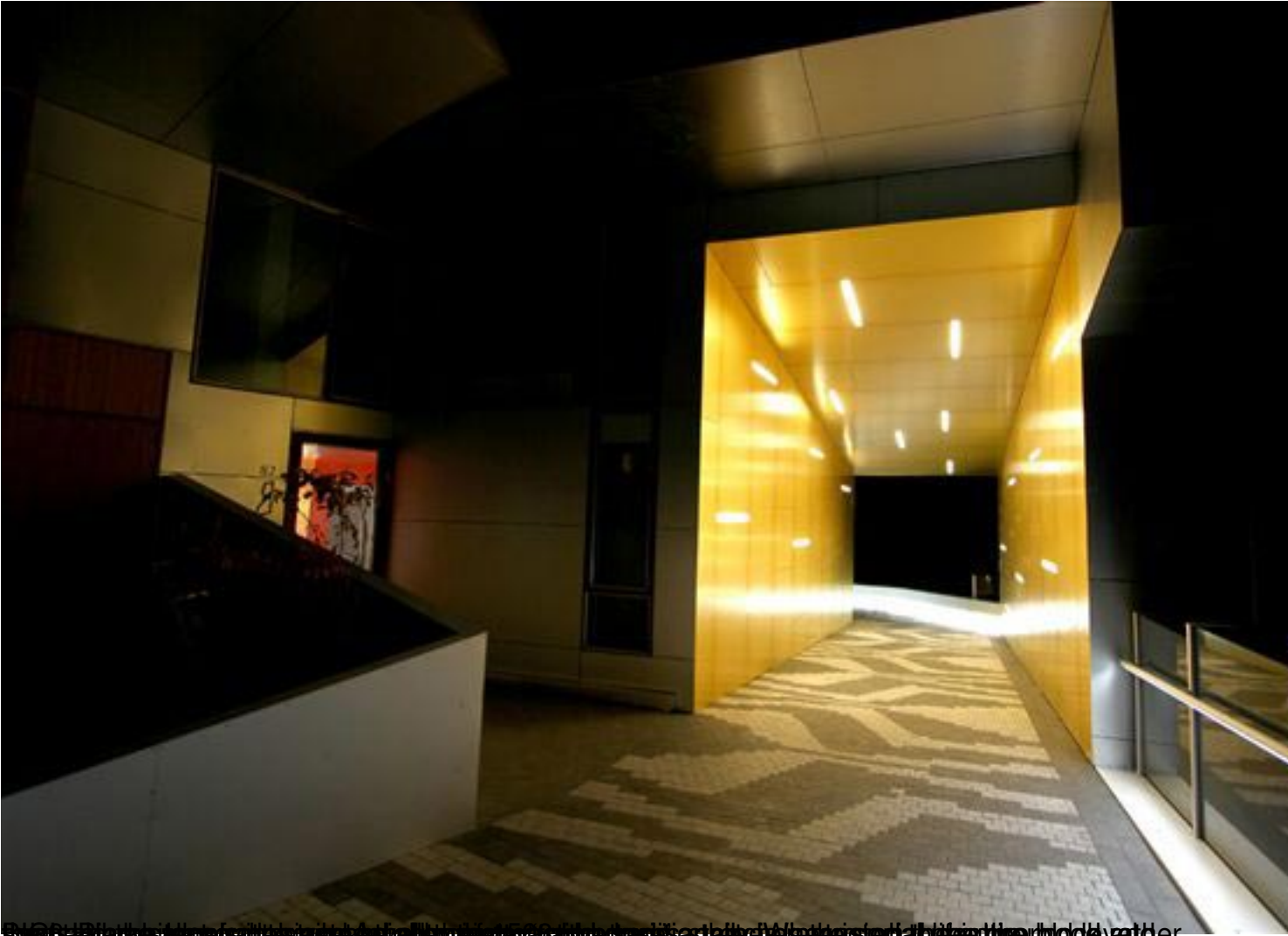
BIG's 8 House Mixed-Use development in Copenhagen. The image shows a modern interior hallway with a patterned carpet and a brightly lit yellow corridor.