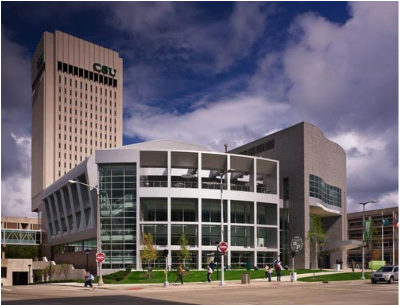
From the tower, students can see the football stadium, the main building, the library, the hotel, and the city.