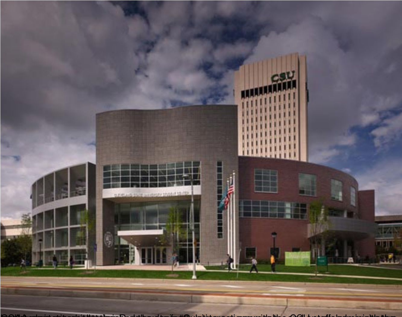
©/A photo of the Cleveland State University Student Center building. The building features a prominent curved facade with large glass windows and a brick section. A tall, slender tower with 'CSU' branding is visible in the background. The sky is overcast with grey clouds. In the foreground, there is a paved plaza with some greenery and a few people walking.