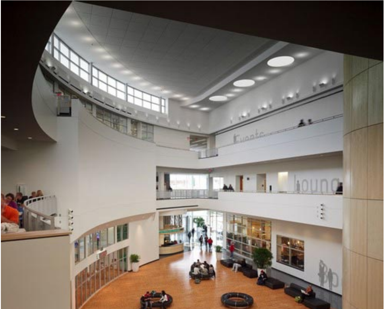
© 2010 Gwathmey Siegel & Associates Architects. All rights reserved. This is a photograph of the Cleveland State University Student Center building. The building is a modern, multi-level structure with a curved ceiling and wooden floor. The space is open-plan and features a central seating area with circular tables and a lounge area with sofas. A balcony on the upper level is labeled "Events" and "Lounge". The architecture is clean and modern, with large windows and a prominent wooden column.