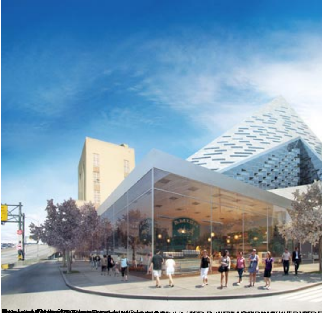
Architectural rendering of the West 57th Street Residential Building in New York City, featuring a prominent glass-enclosed entrance and a large, perforated metal facade.