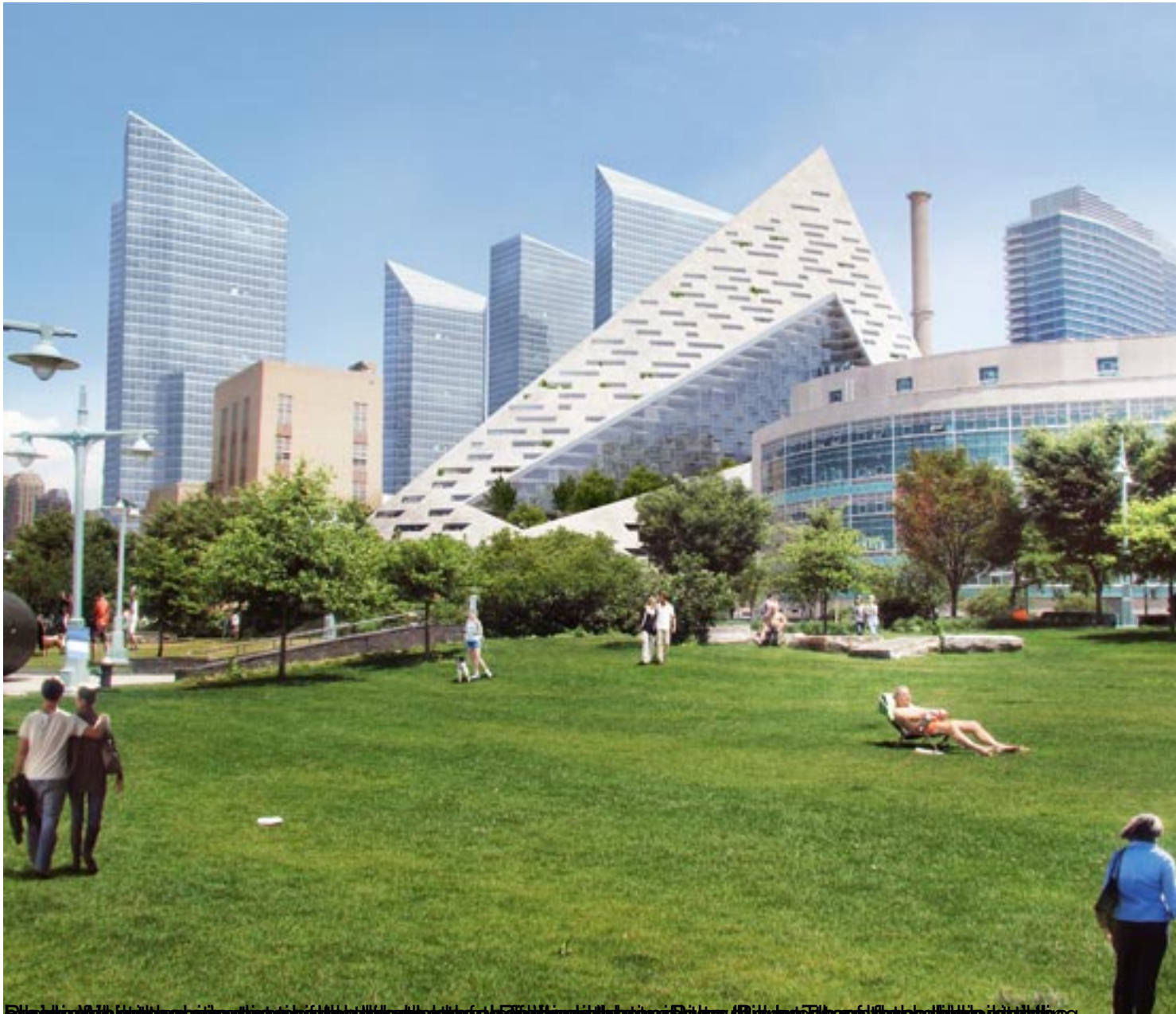
Architectural rendering of the West 57th Street Residential Building in New York City, featuring a large, white, triangular structure with a perforated facade, surrounded by a green lawn and modern skyscrapers.