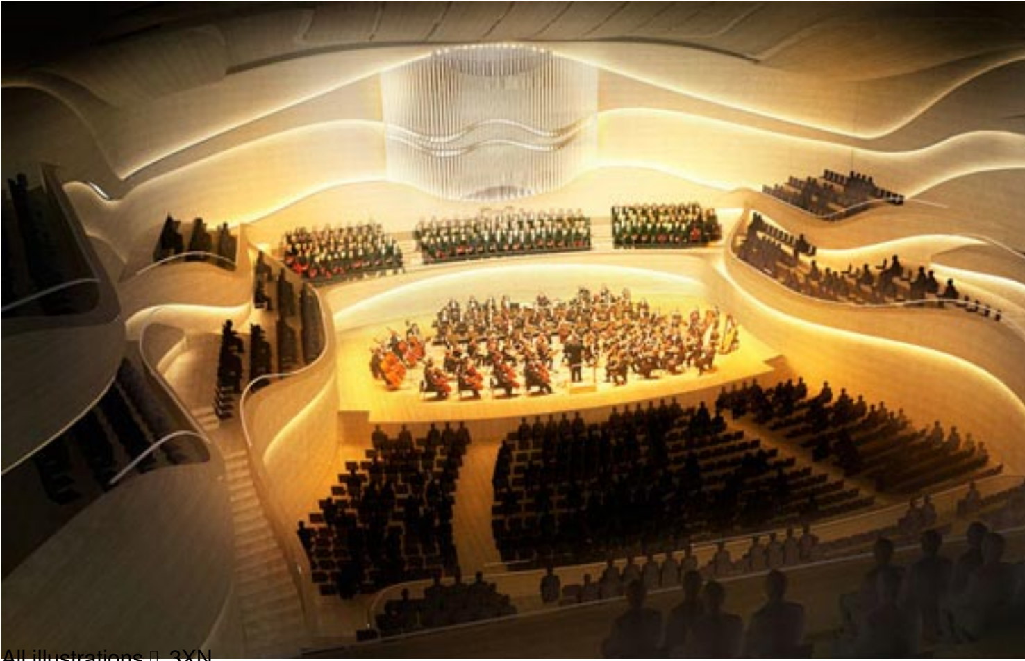
All illustrations © 3XN