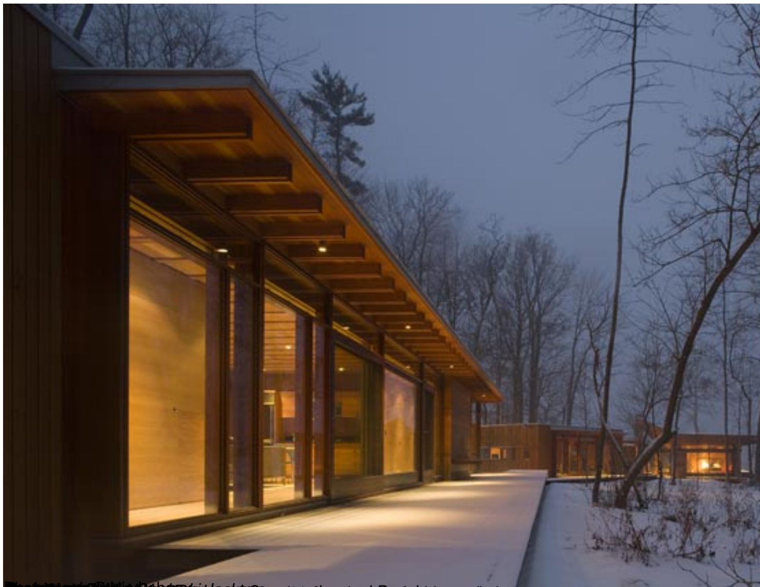
Bohlin Cywinski Jackson Construction and Landscape Architects, Ltd.