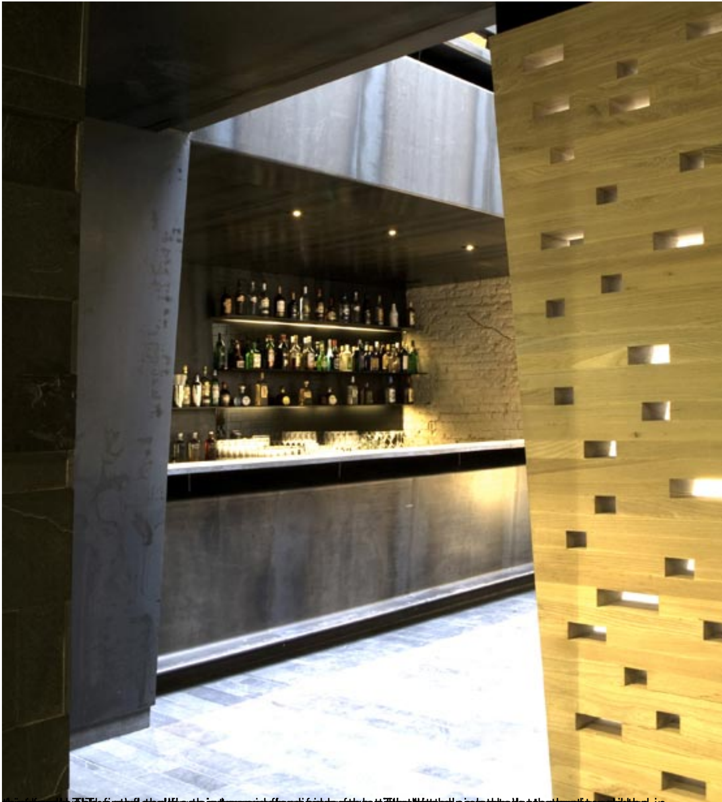
The bar area of the restaurant, featuring a long bar counter, shelves of bottles, and a prominent wooden wall with a grid of rectangular openings.