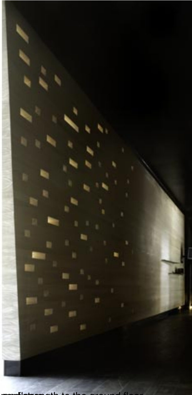
The restaurant's shape is a study in the geometry of light and space, with a length to the ground floor,