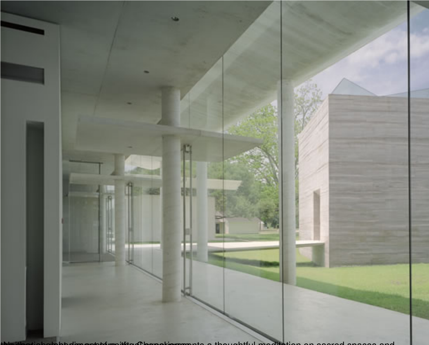
The spatial elements of spiritual experience presents a thoughtful meditation on sacred spaces and the spatial dimensions of spiritual experience.