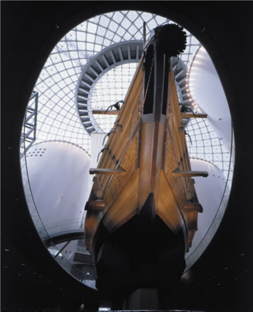
Paul Andreu - Osaka Maritime Museum. The image shows a large, traditional Japanese wooden boat (likely a samurai warship) displayed inside a modern museum. The boat is viewed through a large circular opening in a dark structure, looking up at a complex, white, grid-like dome ceiling. The boat's hull is dark, and its upper structure is light-colored wood. The background shows a large, white, curved architectural element, possibly a staircase or part of the museum's design.