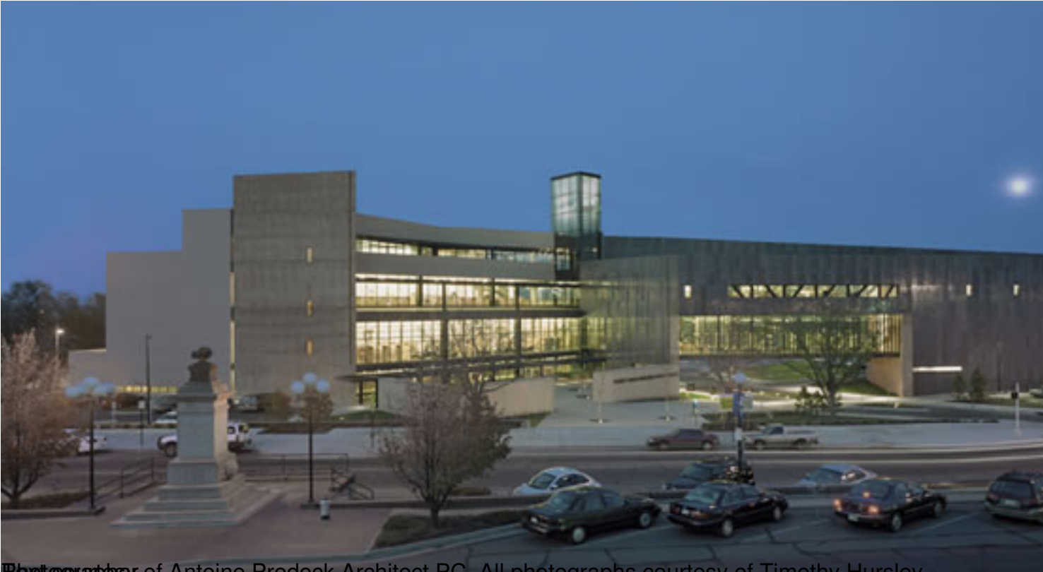
Photographs of Antoine Predock Architect PC.