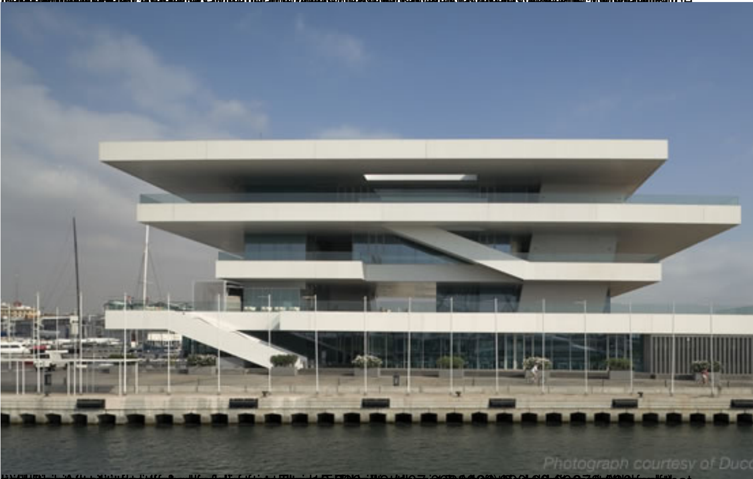
Photograph courtesy of Duccio