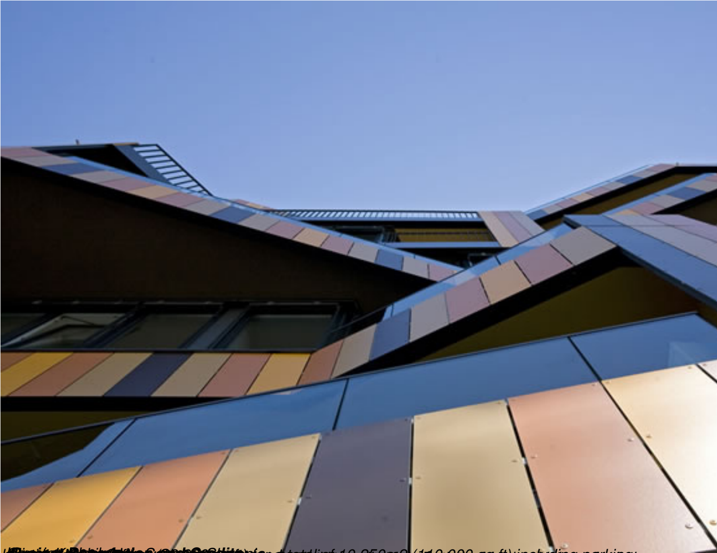
Project: Lace Apartments in Nova Gorica, Slovenia, 2007-2008, 10,250 m 2 (110,000 sq ft) including parking; designed by OFIS arhitekti, Ljubljana, Slovenia; architect: OFIS arhitekti, Ljubljana, Slovenia; contractor: OFIS arhitekti, Ljubljana, Slovenia