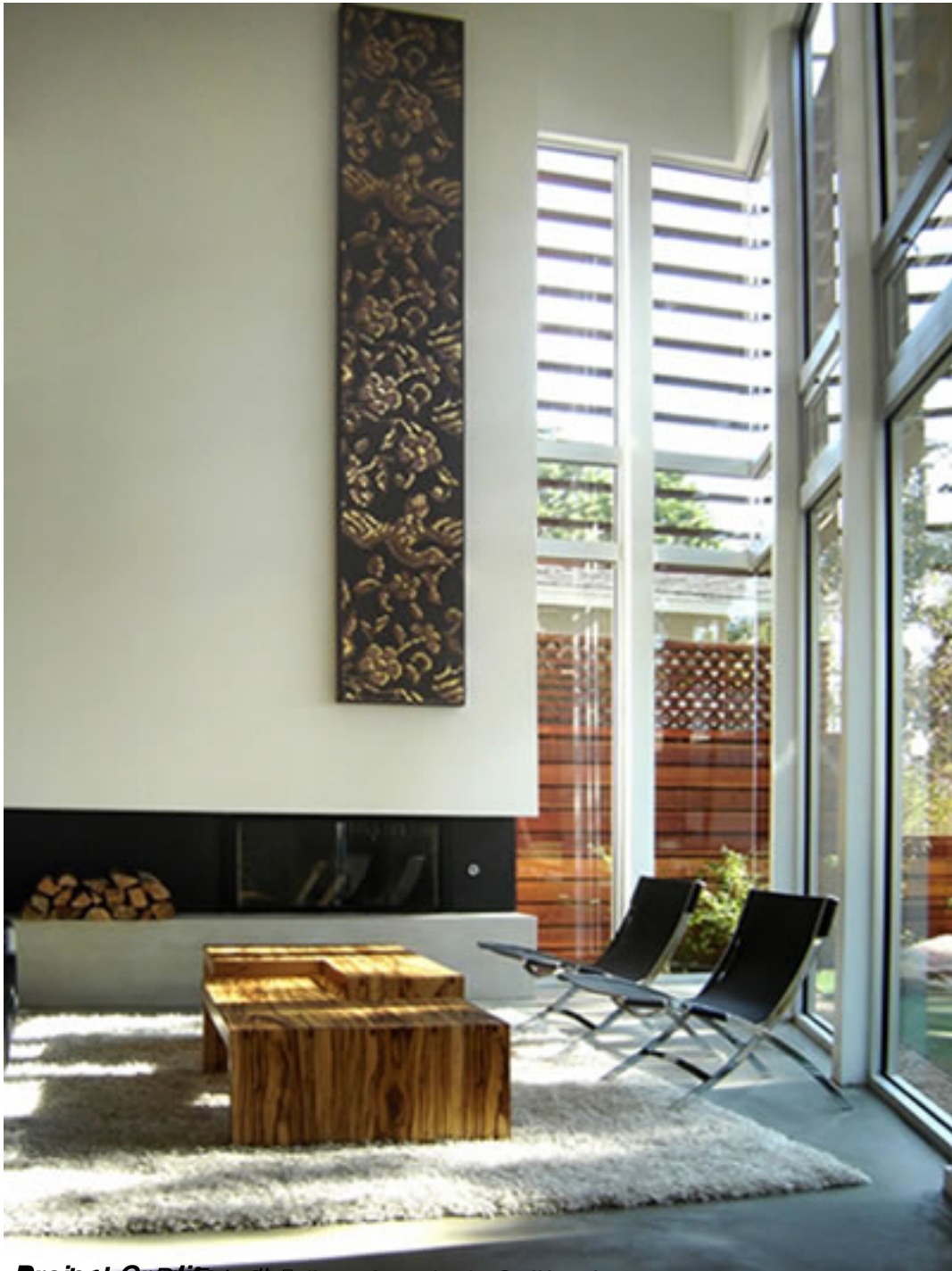
Project Completion (Los Angeles, California). Project completed by DLFstudio in 2006.