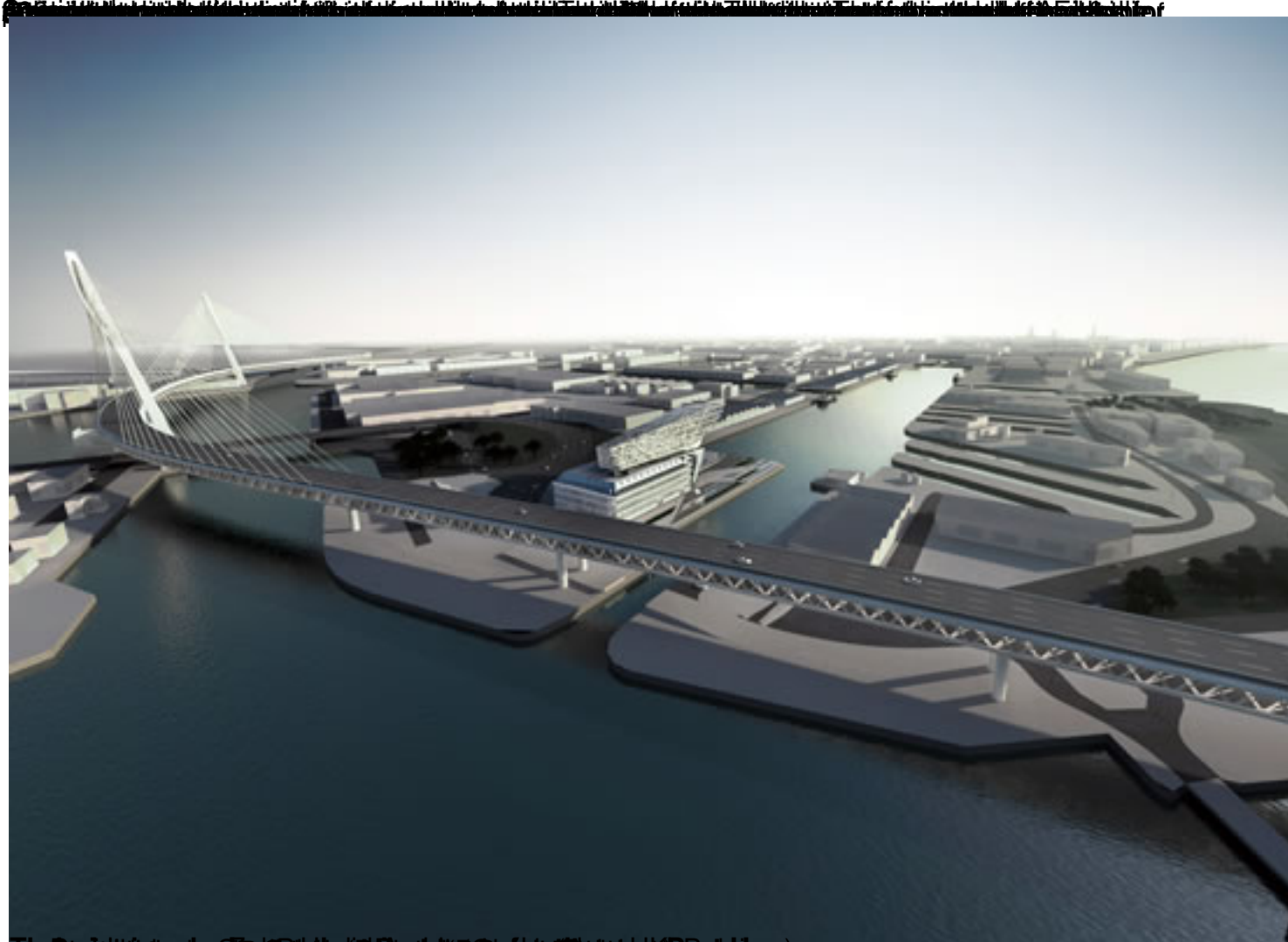
The plans for the new Port House (right) and the new Port House.