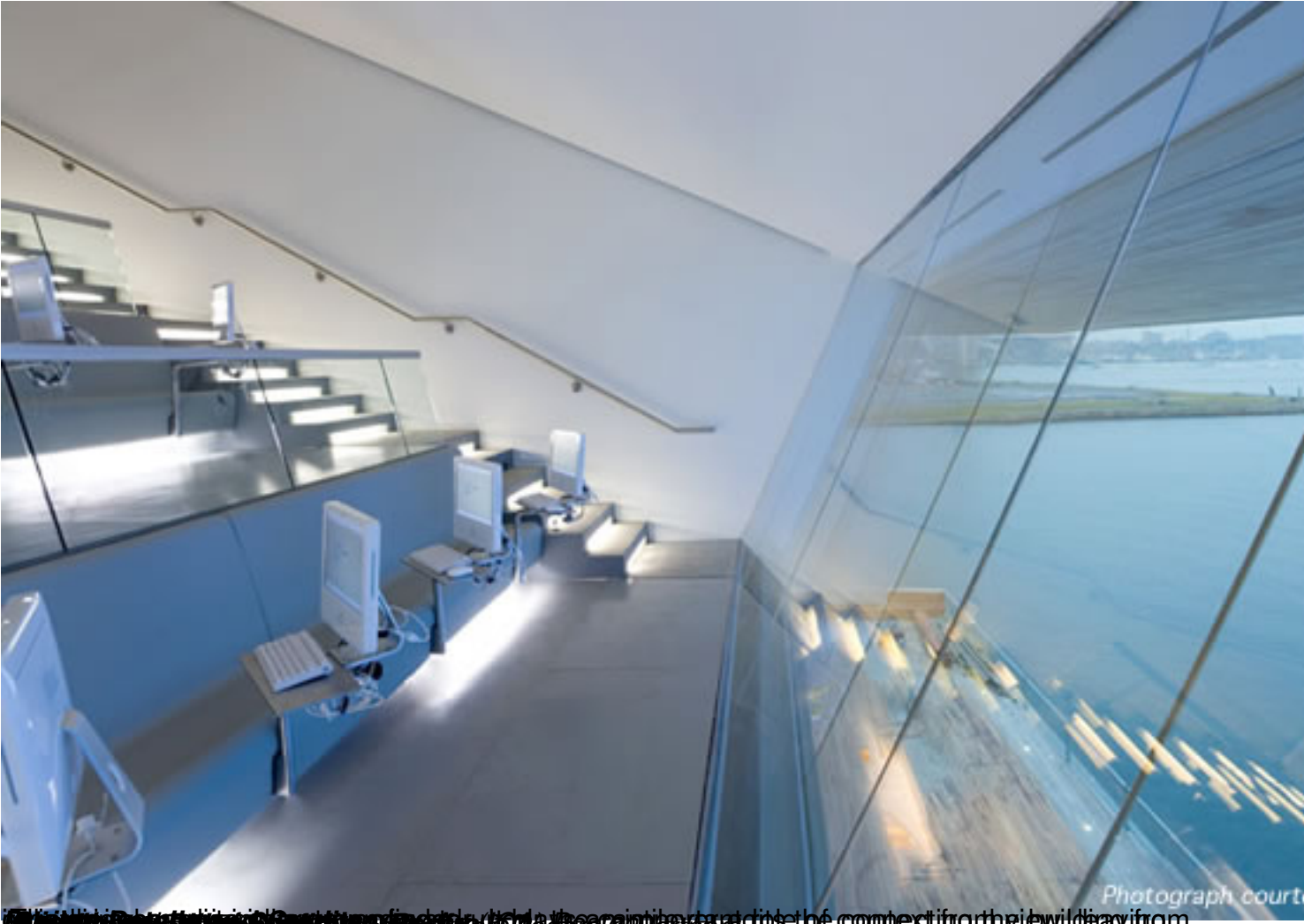
Photograph courtesy of the architect.

Photograph courtesy of the architect. The photograph is intended to provide context for the view from the building. Photograph courtesy of the architect. The photograph is intended to provide context for the view from the building. Photograph courtesy of the architect. The photograph is intended to provide context for the view from the building.