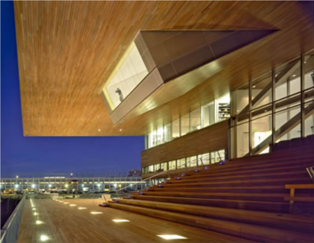
Photograph courtesy of Diller Scofidio + Renfro

© 2009 Diller Scofidio + Renfro. All rights reserved. This photograph is a reproduction of a photograph by Diller Scofidio + Renfro, a registered trademark of Diller Scofidio + Renfro.