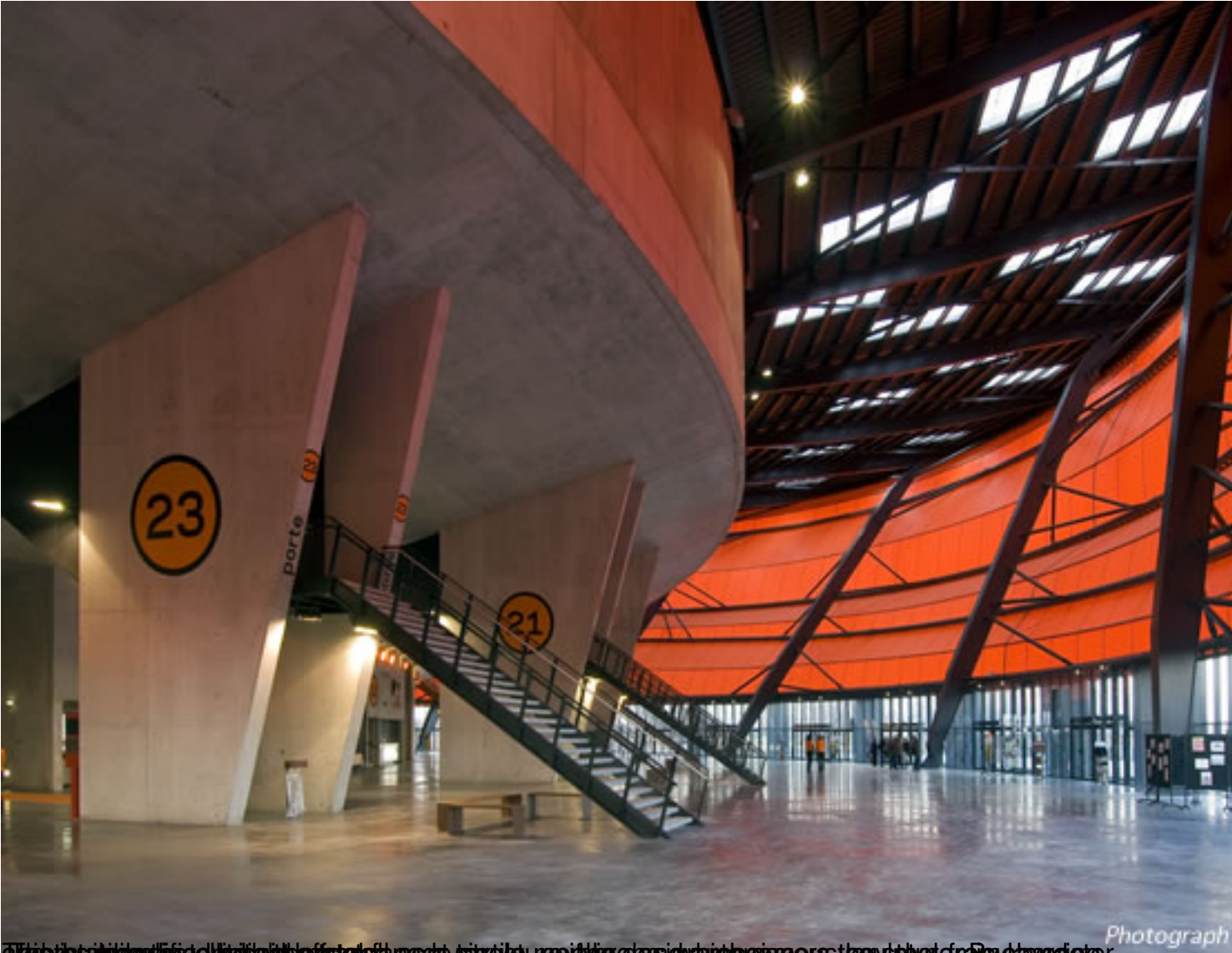
Photograph of the Zenith Strasbourg arena, showing the large, curved concrete structure and the orange lighting.