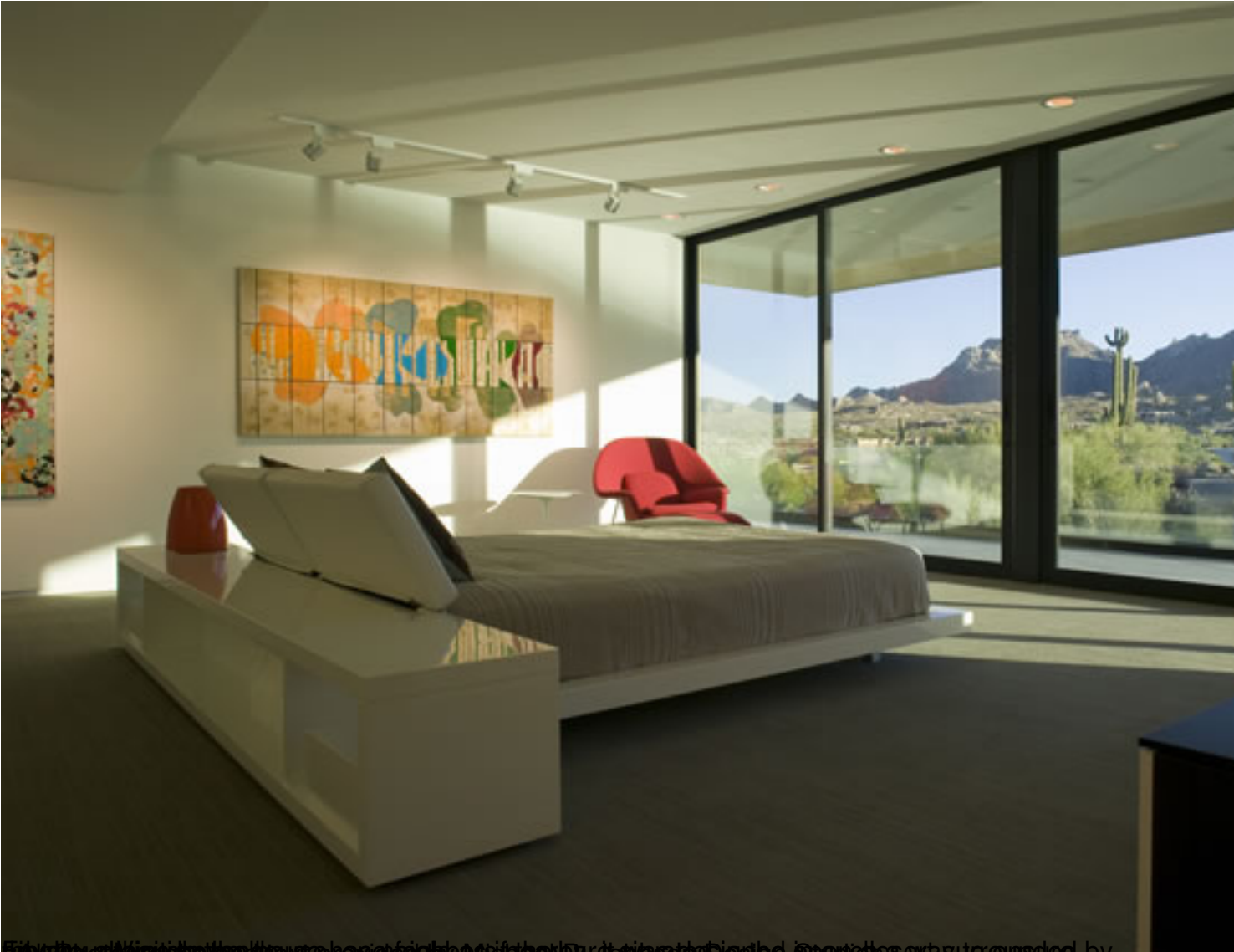
The image is provided by Michael Johnson Design Studios as a courtesy.