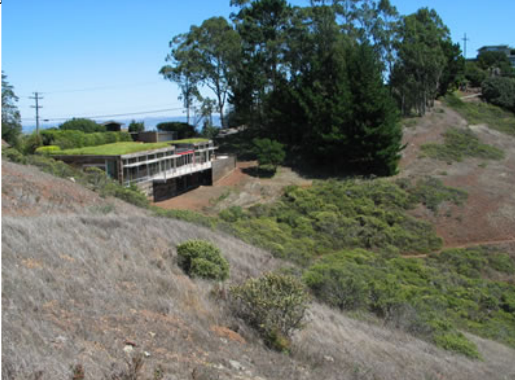
Final(ly) House in Sausalito, California