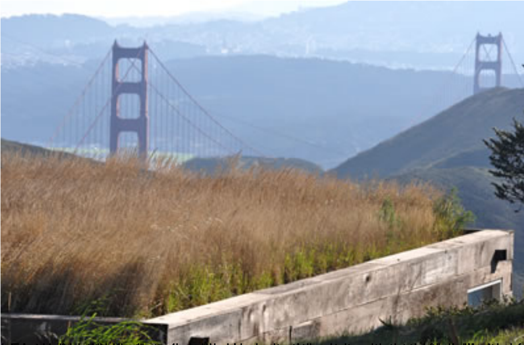
Final(ly) House in Sausalito, California