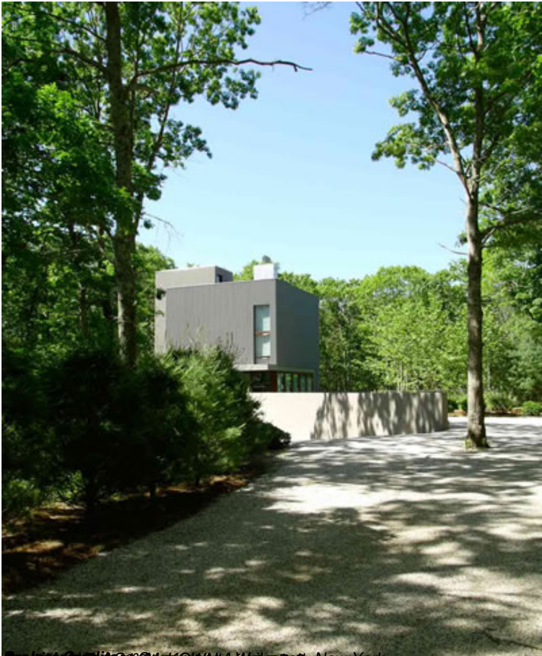
Project: House at Sagaponac in Wainscott, New York.