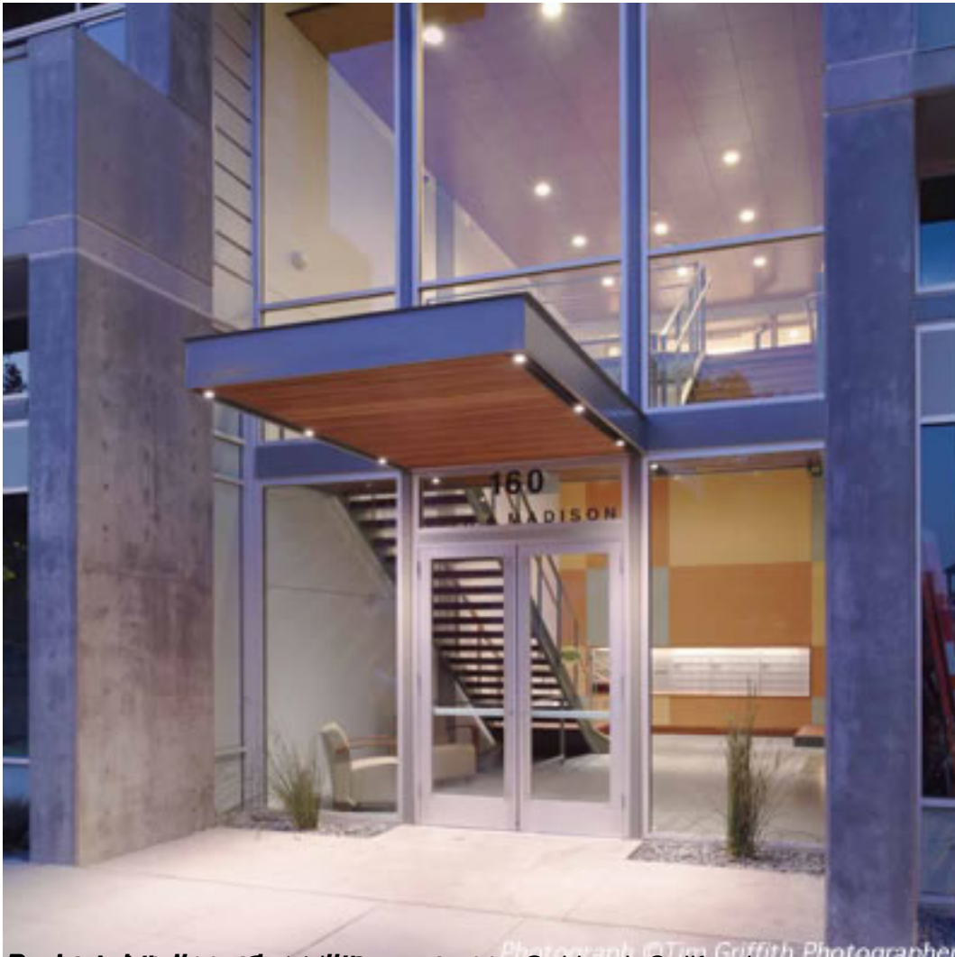
Project: 160 Madison @ 14th Apartments in Oakland, California, CA Electrical Engineers (electrical)