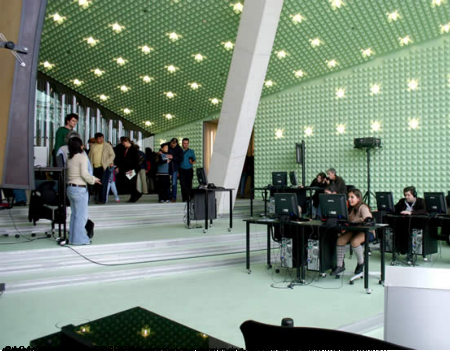
15/11/07, 19:00:00 - Casa da Música, Lisboa, Portugal.