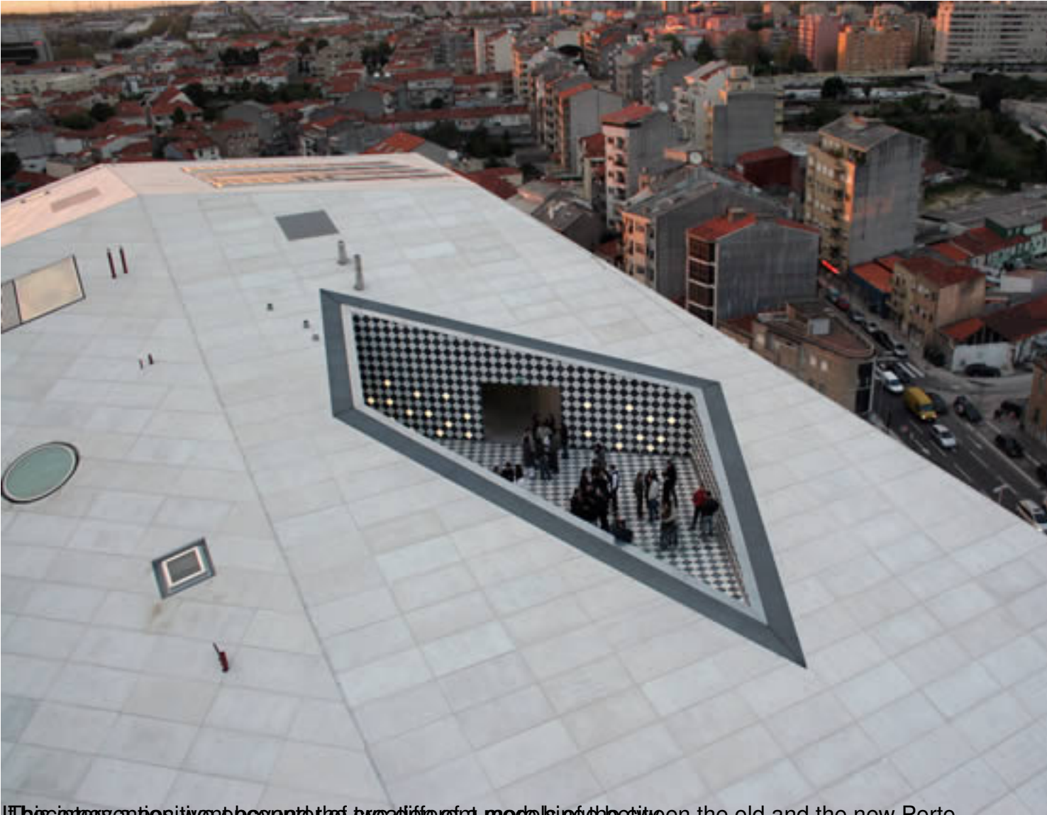
It becomes a positive beyond the tradition of models of the city between the old and the new Porto.