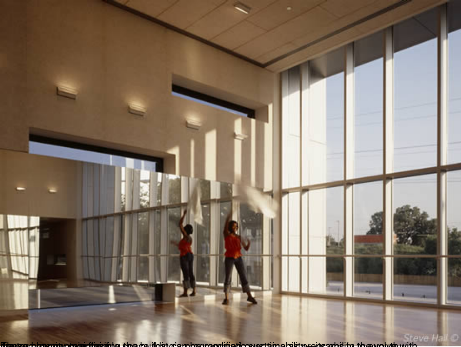
The design team for the Gary Comer Youth Center in Chicago, IL, designed a program of sustainability projects to be implemented with the building's interior space.