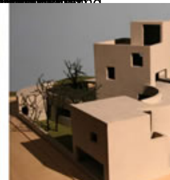
Each model of a house is a study of the building's form and how it relates to the site, while the rendering shows the overall design of the project.