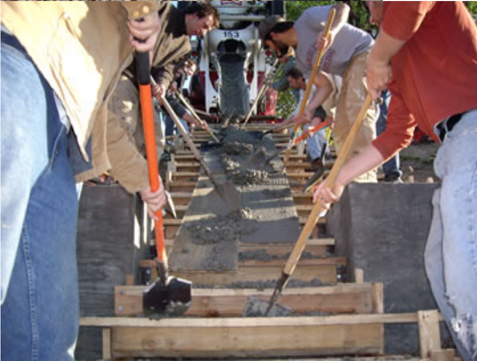
Photo by [unreadable] showing the foundation being poured. Photo by [unreadable] showing the foundation being poured.