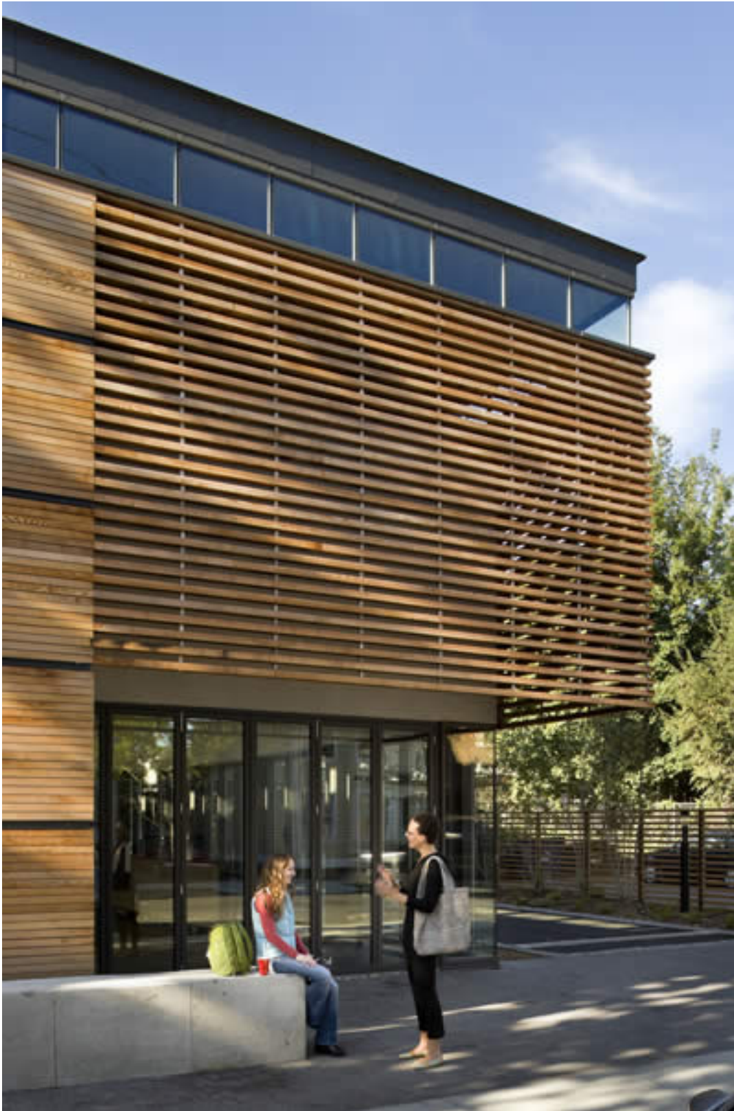
The Yale Sculpture Building and Gallery complex is composed of three new buildings; the four-story Sculpture Building, the single-story storefront Gallery, and the four-story parking garage with retail space at the ground floor. While the Gallery and parking