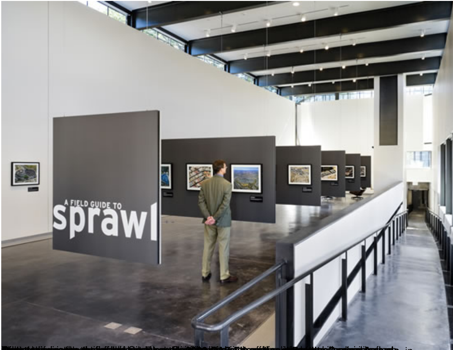
Photo: Kieran Timberlake, 'A Field Guide to Sprawl', Yale University Sculpture Building and Gallery, New Haven, Connecticut, 2009. The exhibition was designed by Kieran Timberlake, in