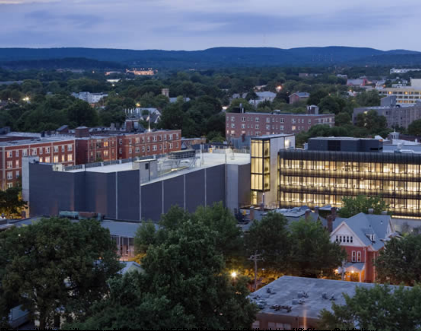
Copyright © Kieran Timberlake. All rights reserved. This is a work of art. No part of this work may be reproduced, stored in a retrieval system, or transmitted, in any form or by any means, electronic, mechanical, photocopying, recording, or by any information storage and retrieval system, without the prior written permission of Kieran Timberlake.