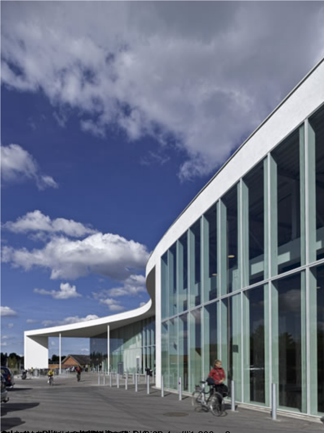
© Schmidt Hammer Lassen Architects. Birkerød Sports and Leisure Centre, 2009. Photo: A/S Bygghøj, Birkerød, Denmark. Design: Schmidt Hammer Lassen Architects. Photo: A/S