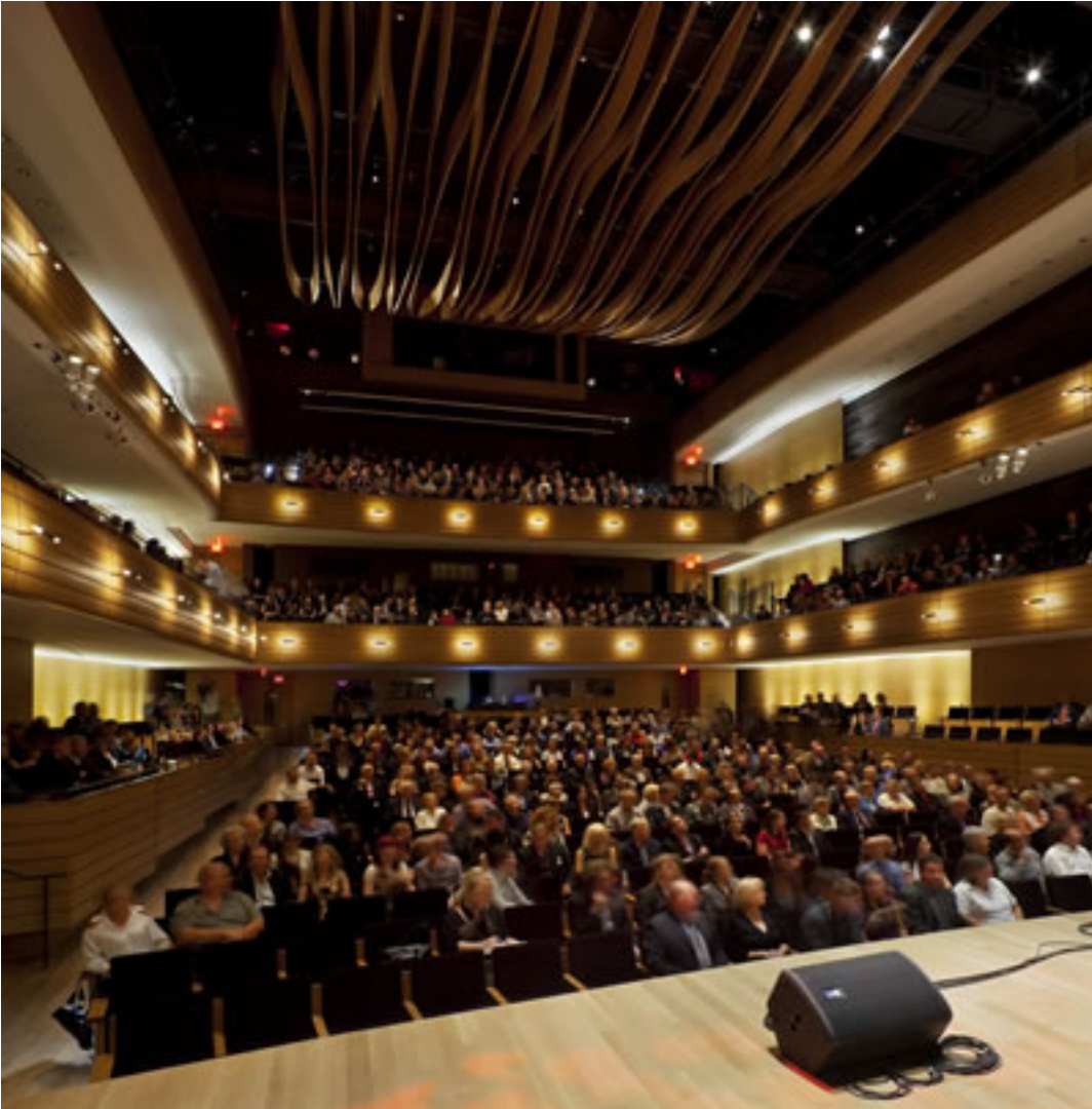
Public space for the TELUS Centre for Performance and Learning in Toronto.