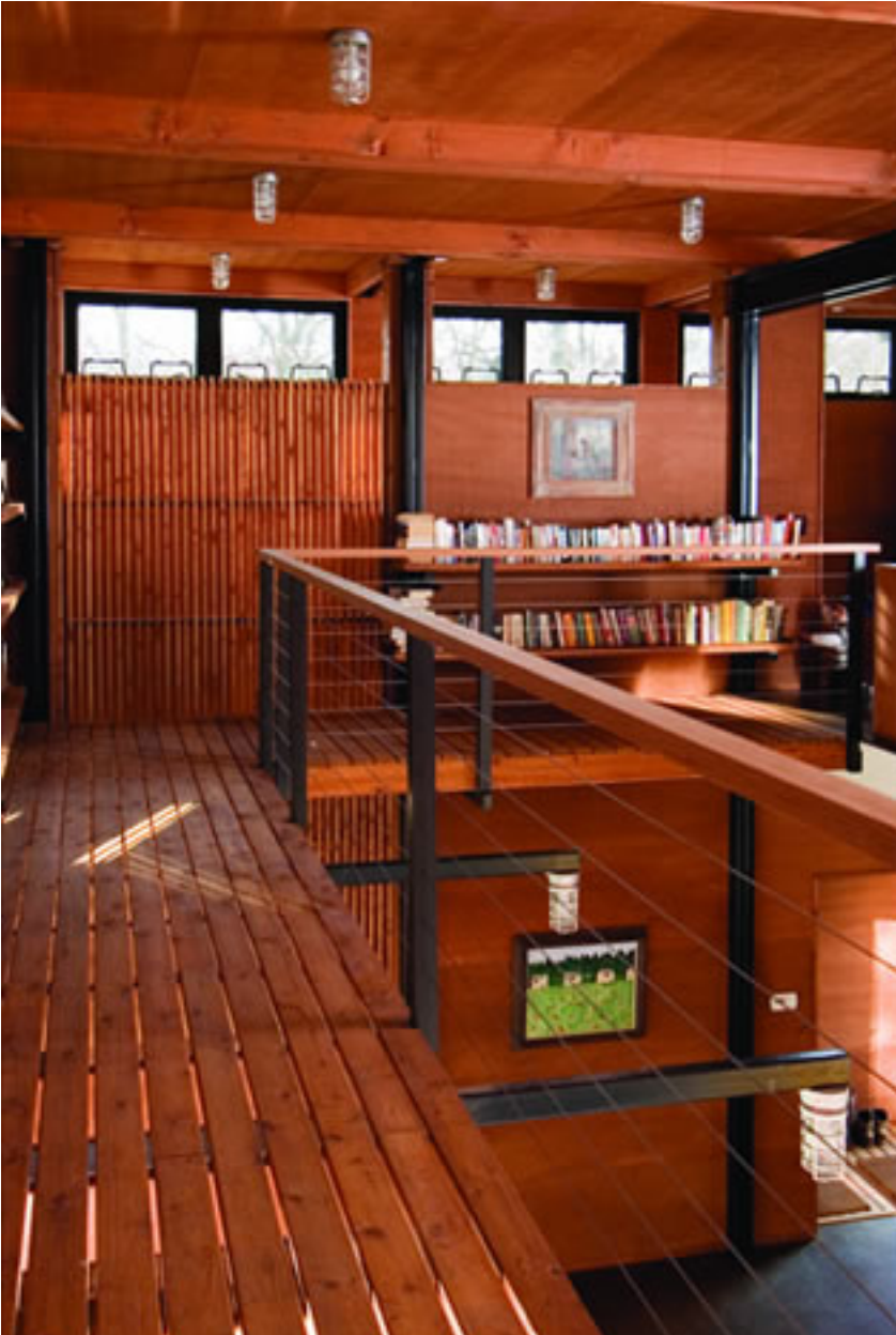
Repeating wood slats, handrails, and original slats, re-used high walls are made of the same material throughout