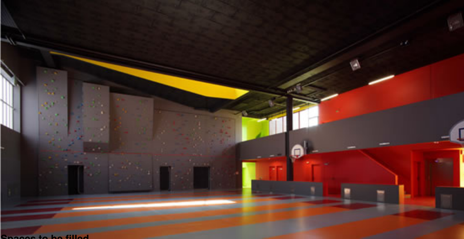
Spaces to be filled