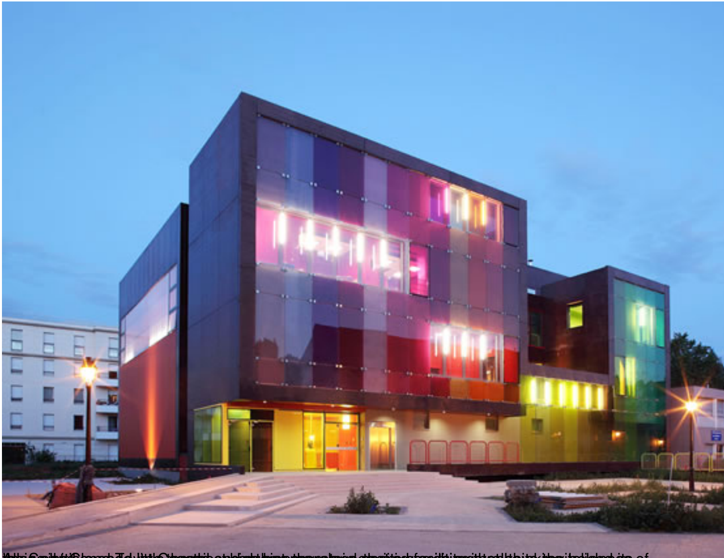
The Saint-Cloud Town Center, which has many high quality facilities, is a true reflection of