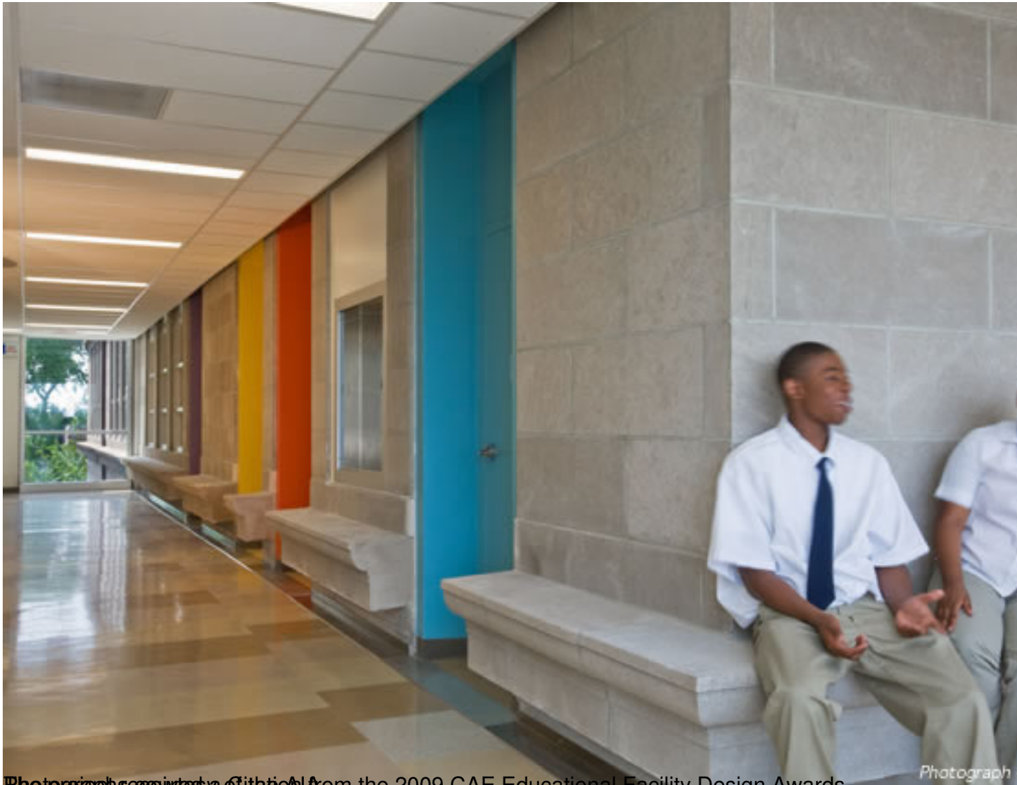
From the 2009 CAE Educational Facility Design Awards.