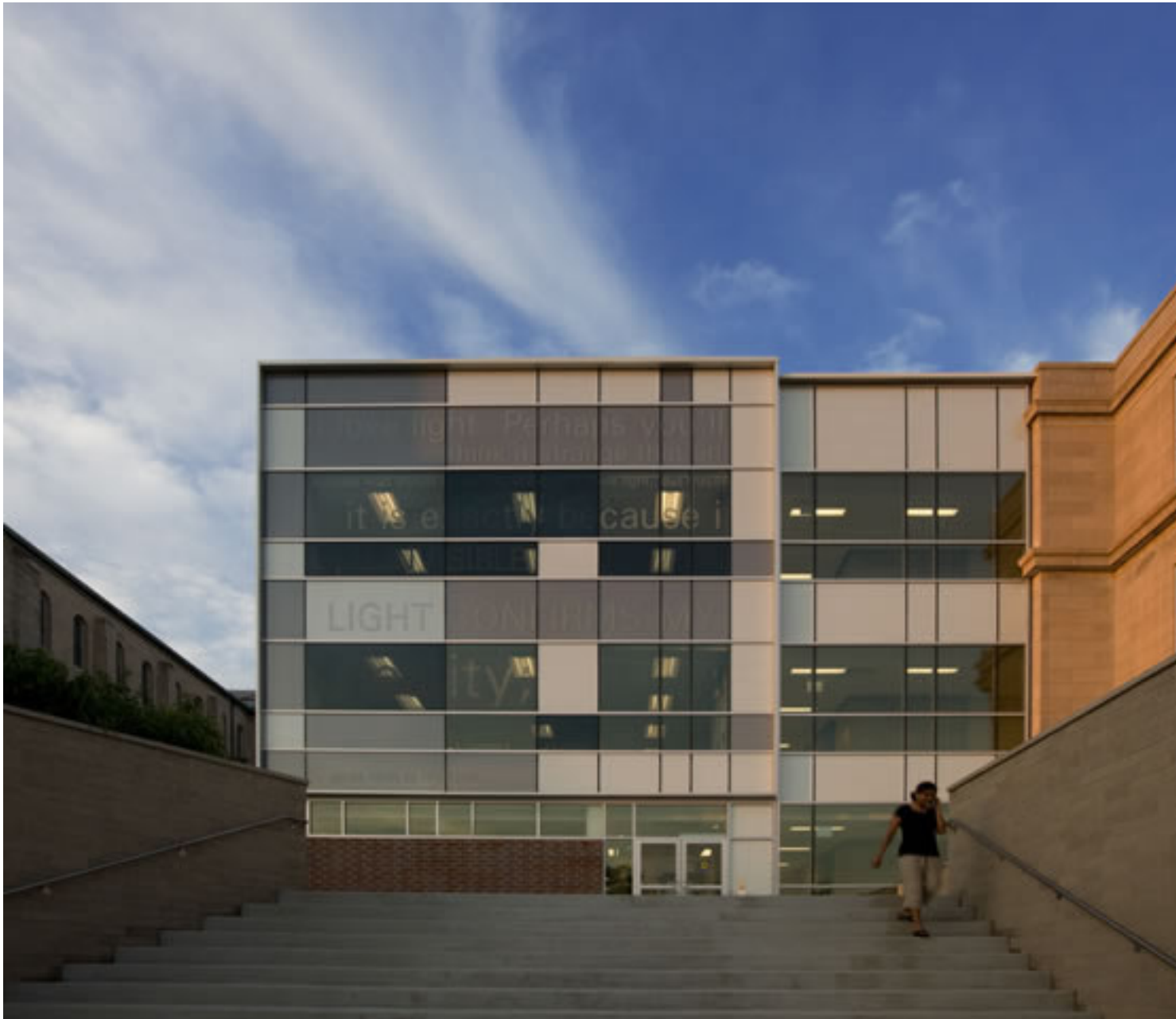
The image is a photograph of a modern building with large glass windows and a brick base, viewed from a low angle looking up. The sky is blue with light clouds. A person is walking on a wide set of concrete stairs in the foreground. The building's facade features large glass panels with some text visible, including 'LIGHT' and 'cause i'. The word 'Photograph' is partially visible in the bottom right corner of the image.