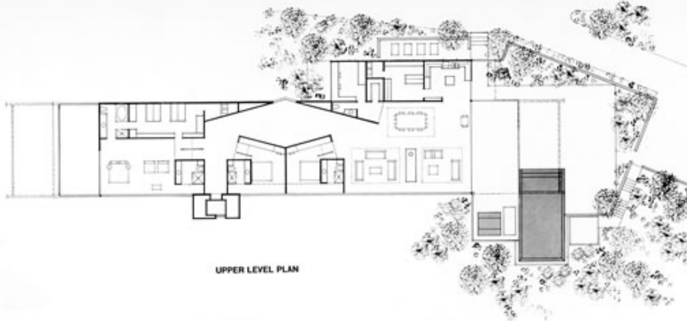
UPPER LEVEL PLAN

Wednesday, 18 November 2009 05:46 - Last Updated Monday, 23 November 2009 14:01