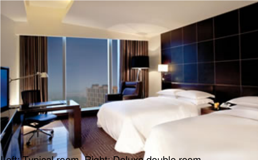
Left: Typical room Right: Deluxe double room