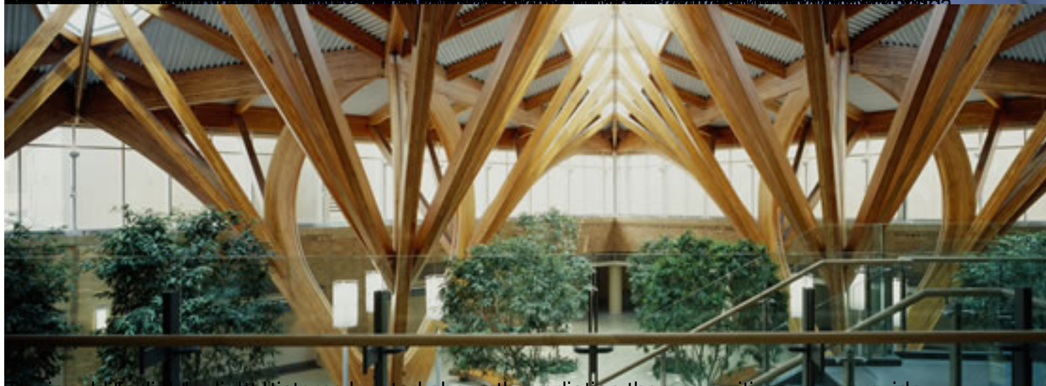
Large wooden skyweight truss structure located above the radiation therapy waiting areas provide