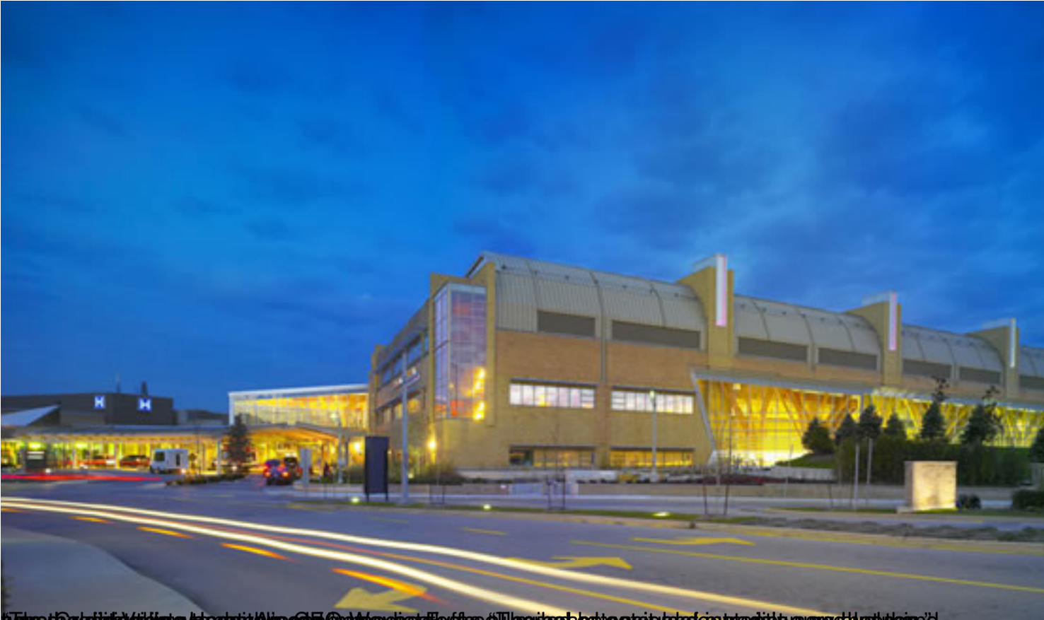
© 2009 Credit Valley Hospital. All rights reserved. Credit Valley Hospital is a registered trademark of Credit Valley Hospital.