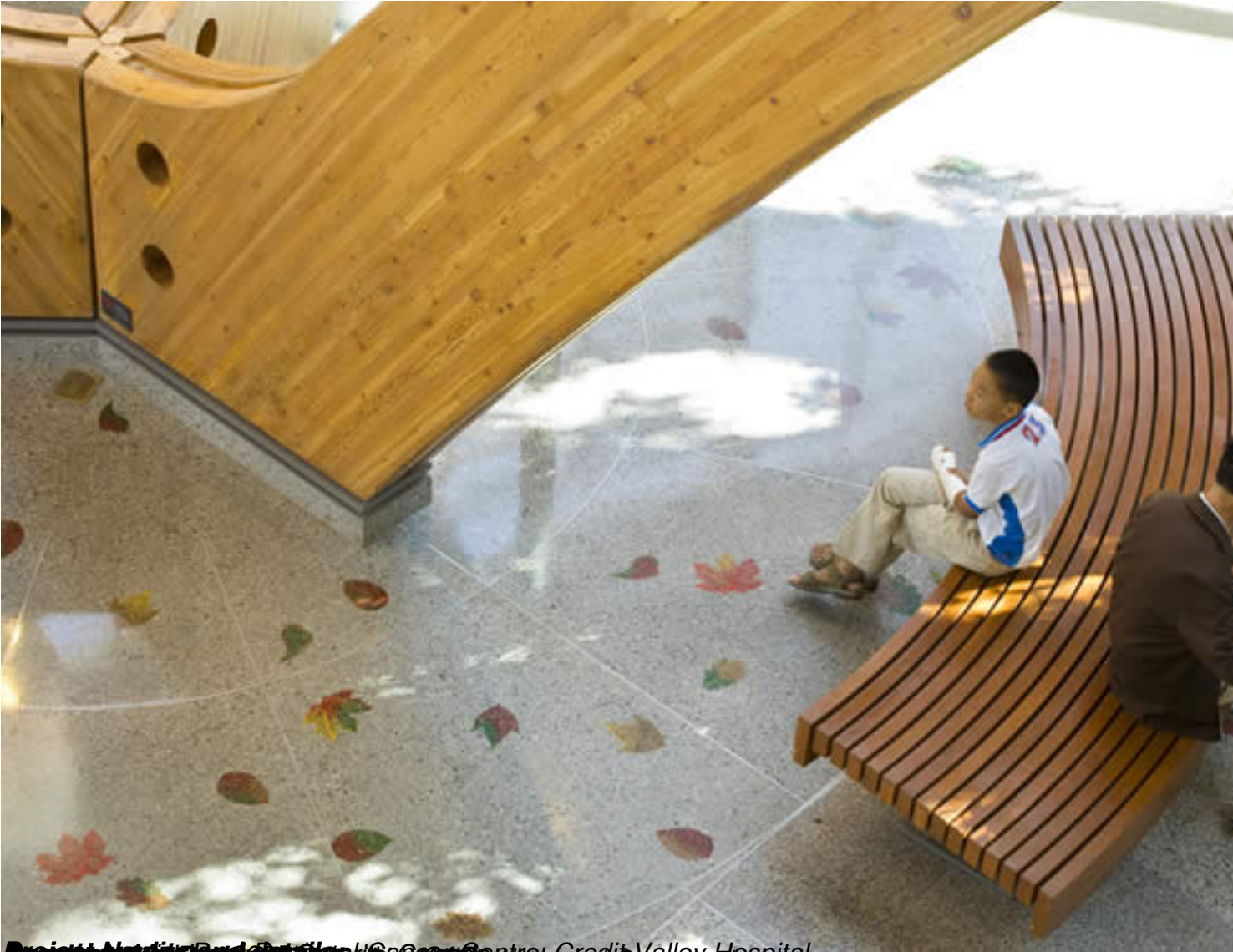
Project: Peel Regional Cancer Centre, Credit Valley Hospital Architect: Farrow Partnership, Interior Design: Farrow Partnership Contractor: Farrow Partnership, Construction: Farrow Partnership