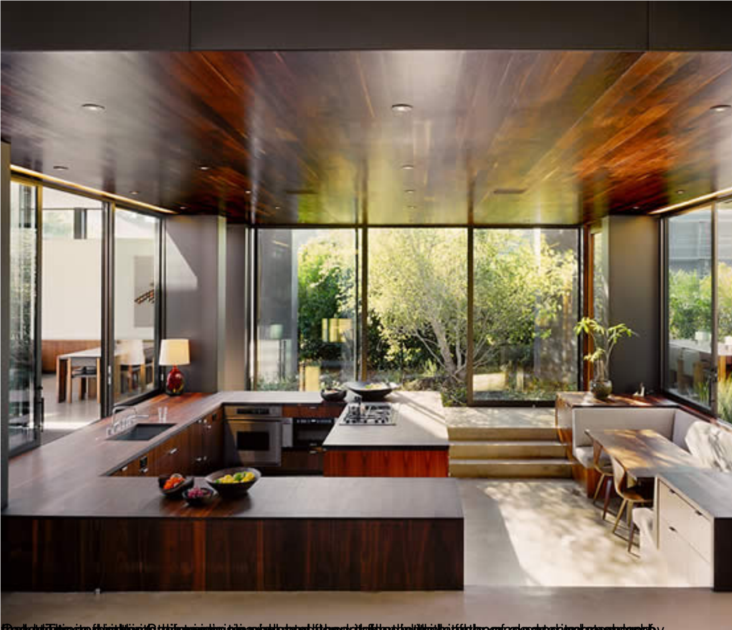
Dark wood ceiling with recessed lighting, dark wood cabinetry, white countertop, and large windows overlooking a lush garden.