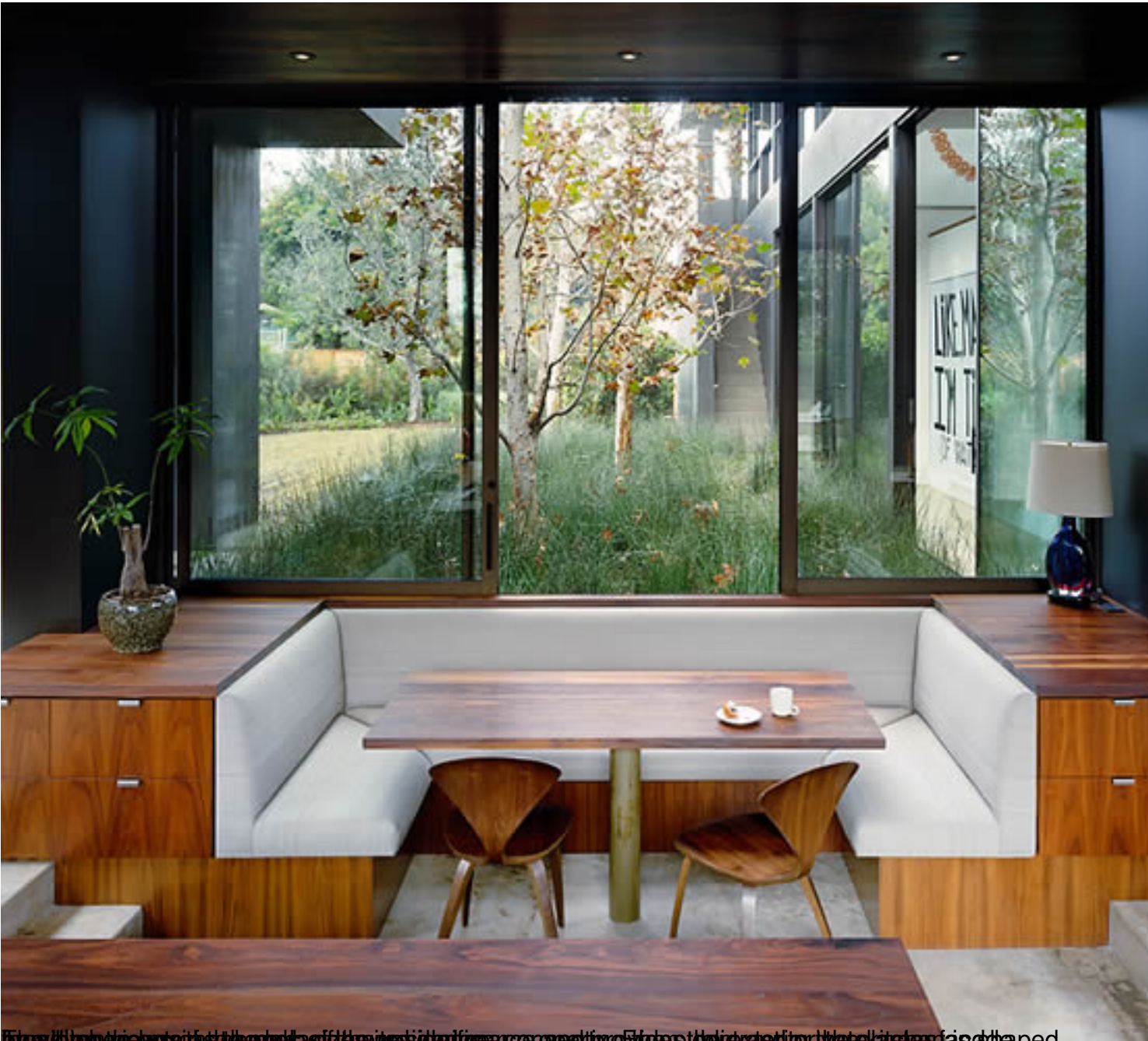
From the kitchen, the view of the residence opening from the east to the lake is framed by the built-in table and chairs.