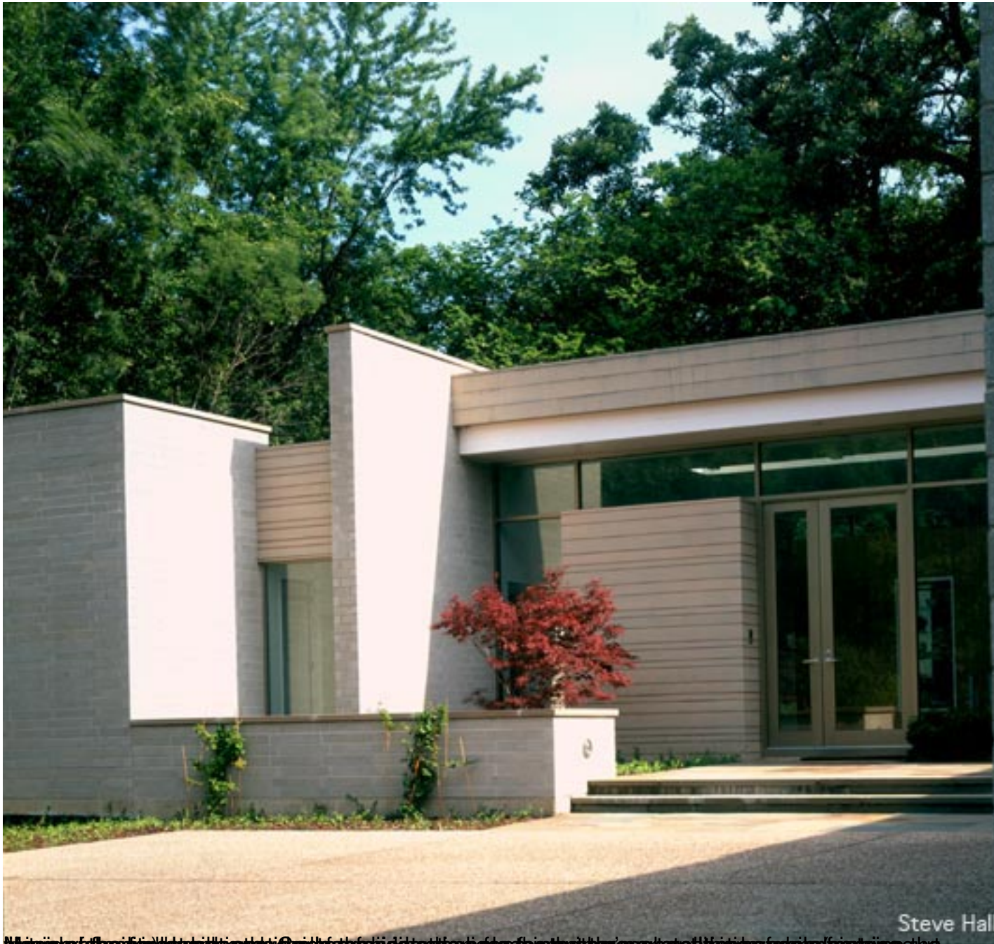
View of the house at the edge of the forest in Northbrook, Illinois. The house is a modern, single-story home with a minimalist design. The house is surrounded by lush green trees, and a paved driveway leads to the entrance.