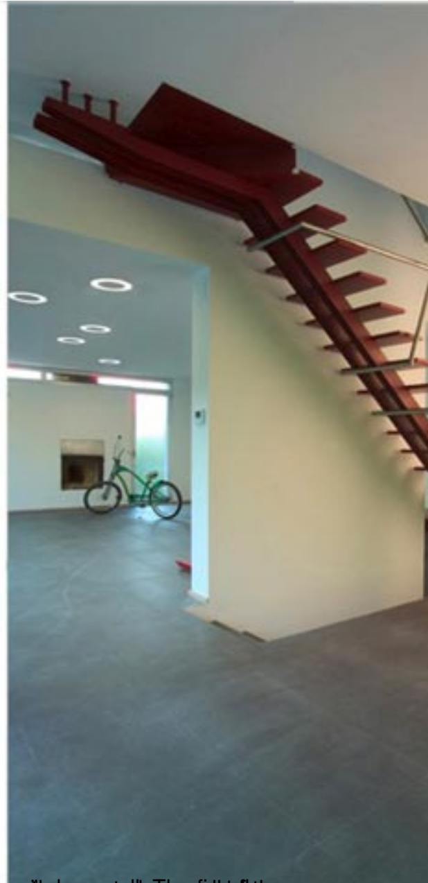
The image is a section of the building, showing the concrete pillar and the metal handrails. The walls are white and the floor is a light color. The ceiling has several circular lights. The overall design is modern and minimalist.