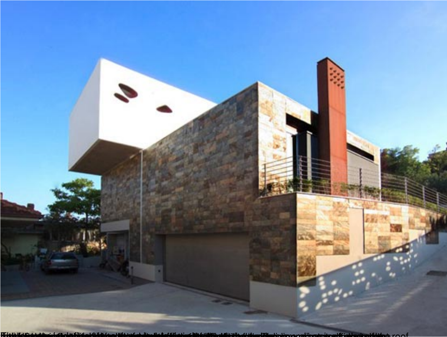
The cantilevered upper volume, the perforated stone wall, the tall chimney stack, the balcony, the roof,