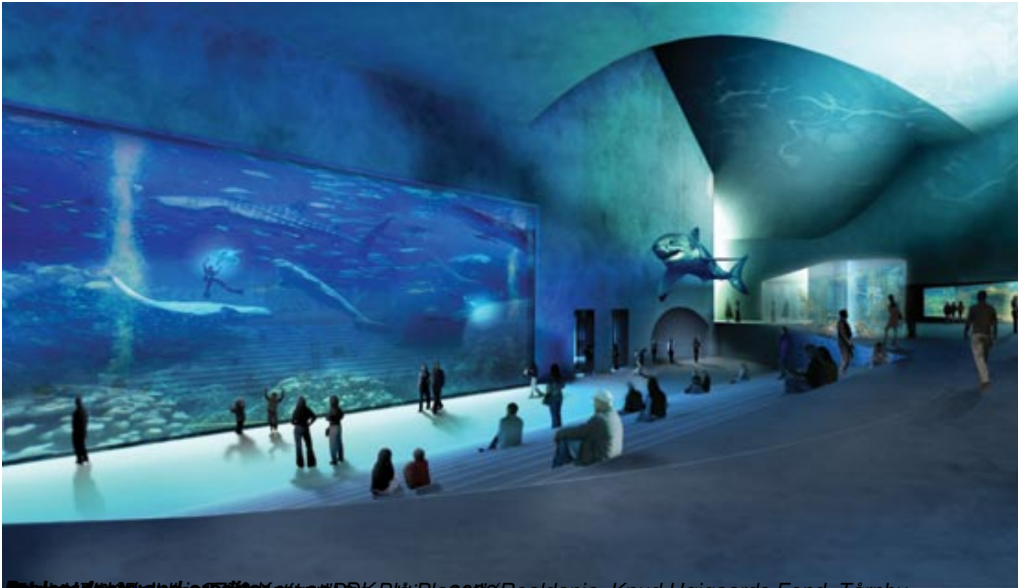
Engelund, 2010.