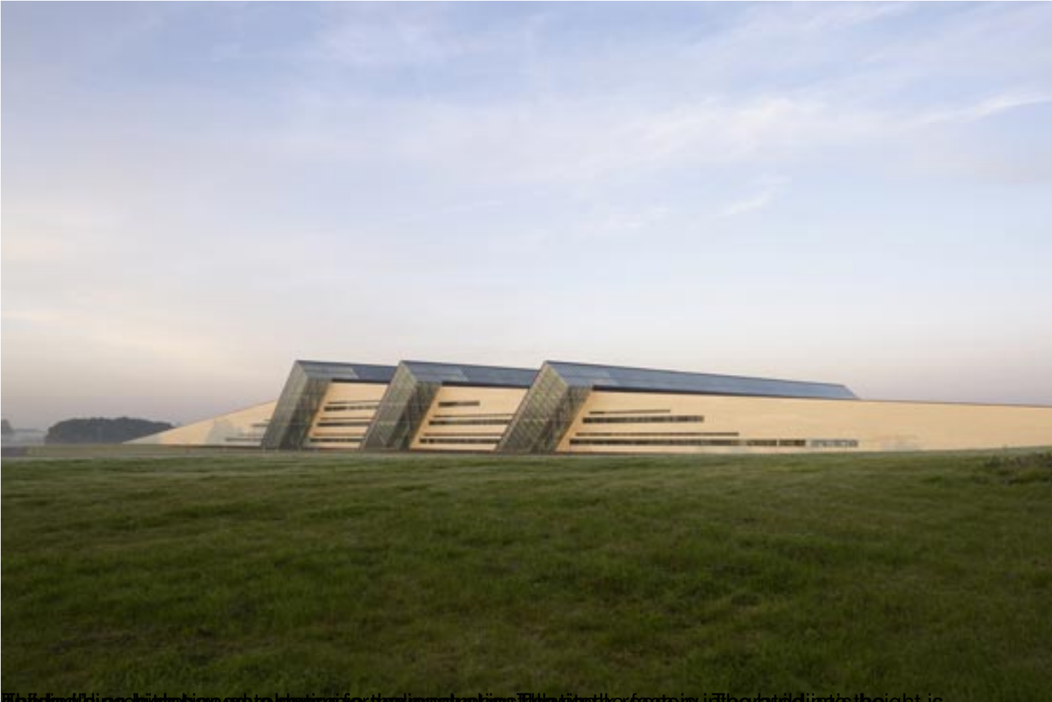
The building's high bay end is typical for the production of the factory. The building's height is