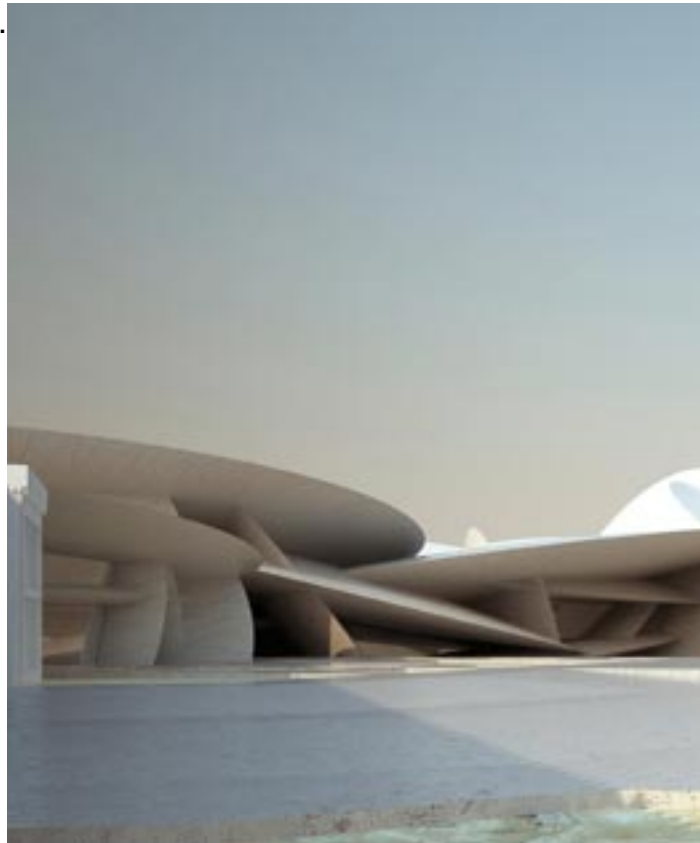
National Museum of Qatar, North View

A great effort is currently being exhorted to transform the small state of Qatar into a hub of culture and communications for the Gulf region. The Qatar Museums Authority (QMA) has just announced its plans for the new National Museum of Qatar, as expressed in an evocative design by Pritzker Prize-winning architect Jean Nouvel.